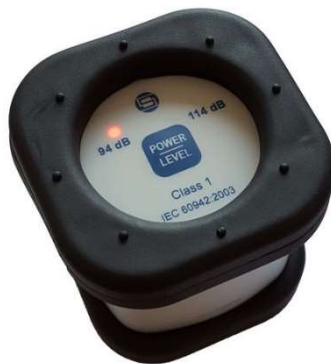
Picture 4. The top view of the SV 35A calibrator with one diode on

Before reaching acclimatization time SV33A cannot be used as a reference sound source!