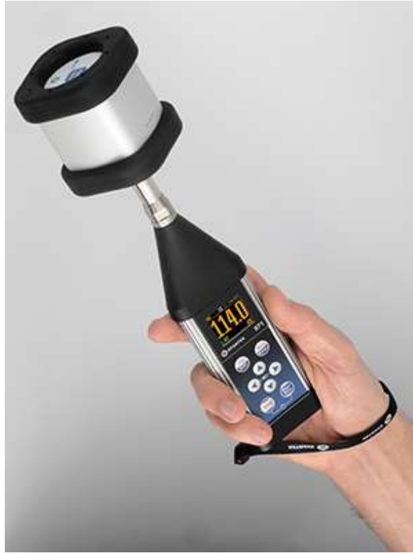
Picture 2. Calibration of the SVAN 971 sound level meter with a \frac{1}{2} " measurement microphone

The SV 35A is designed for calibration of sound level meters with \frac{1}{2} " and \frac{1}{4} " microphones. Picture 2 shows the calibration of Class 1 sound level meter SVAN 971 with a \frac{1}{2} " microphone.