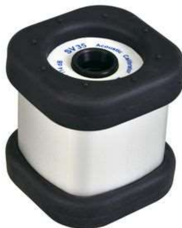
Picture 1. Acoustic calibrator SV 35A

Due to the feedback regulation loop the SV 35A calibrator does not require adjusting and operates in a wide range of temperatures and humidity (see SV 35A Datasheet).