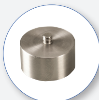
SA 27 Mounting Magnet