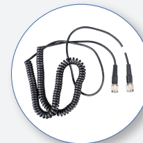
SC 27 TNC/TNC coil cable