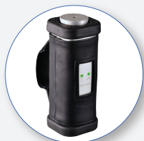
SV 110 Hand-held Vibration Calibrator